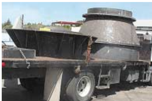
▶ Large Diameter Fabrications