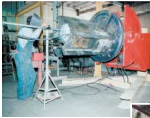
◀ Automated Bore Welding