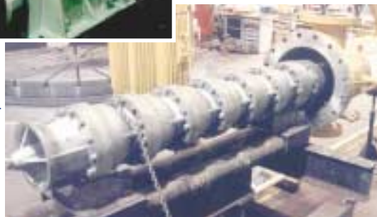
Multi Stage Pump Overhaul ▶