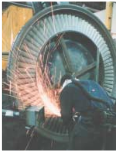
Turbine Diaphragm Repairs

Unico handles all types of welding jobs – in-house or in the field. For ASME code projects, we work with Therma-Flite, Inc. In the field we fit all types of weldable pipe and handle structural applications. The fabrication division manufactures pressure vessels, heat exchangers, screw conveyors, mixers, and thermal process equipment, just to name a few. With our welding positioners and part rotators, we can easily resize housing bores and refit parts rather than replacing them.