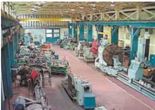
East end of Unico Services' Machine Shop in Benicia, California

Today Unico provides service and manufactured equipment to a broad range of industries including petro-chemical, chemical, power-generation, food processing, aerospace and others.