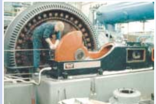
▶ Compressor Overhaul