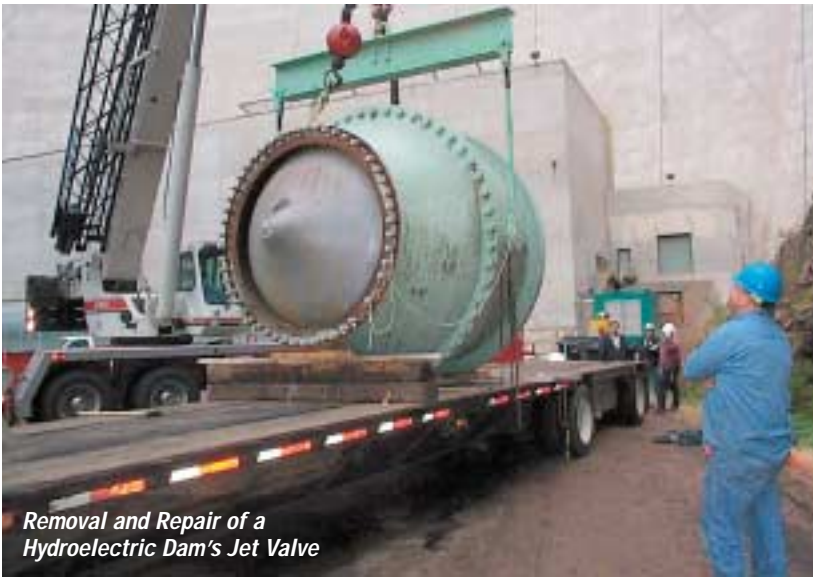
Removal and Repair of a Hydroelectric Dam's Jet Valve