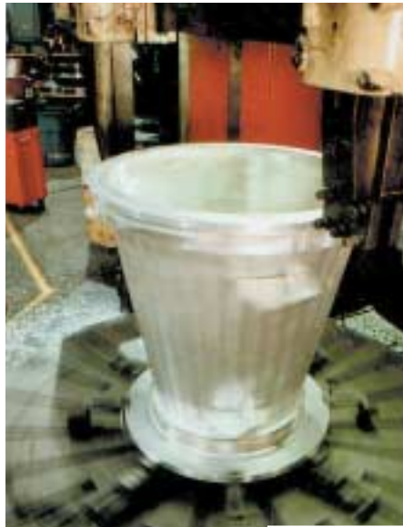
Large Boring Lathe Manufacturing an Aluminum Cone for the Aerospace Industry

The machine shop's operational length and outer diameter capabilities are greater than any facility in Northern California. Unico employs expert machinists who have many years of experience in the manufacturing of replacement and prototype parts. Unico commonly manufactures replacement parts such as compressor pistons, shafts for all types of rotating equipment, rings, flanges, sleeves, bushings, and cylinder liners. On a machining repair basis, Unico frequently performs modifications, resizes parts and trues mating surfaces.