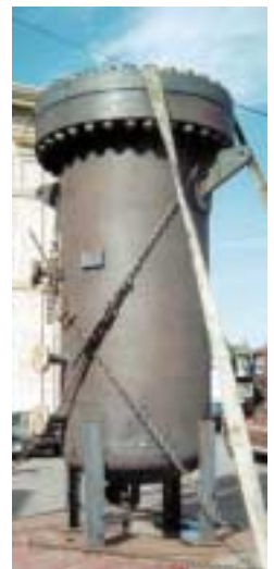
▶ Designed and Fabricated A.S.M.E. Coded Pressure Vessel