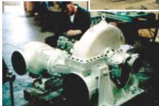
◀ Turbine Upgrades