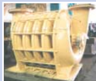
▶ Blower Reconditioning