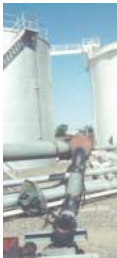
◀ Field Pipe Welding