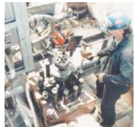
Field Machining — Cylinder Boring