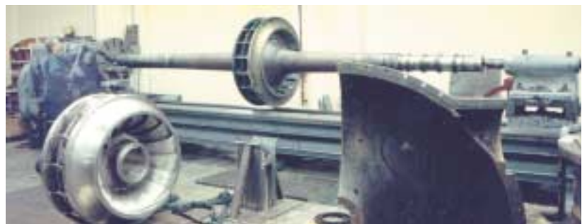
Engine Lathe — Hydro Turbine Repairs