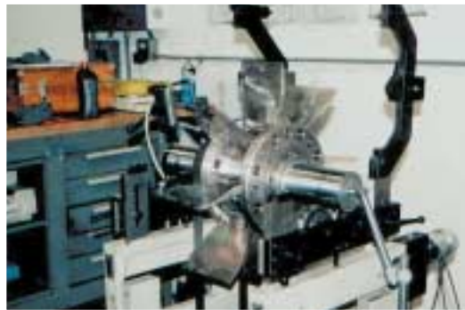
◀ Dynamic Balancing