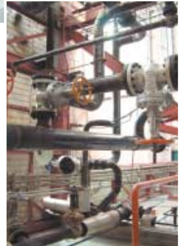
▼ New Equipment and Piping Installation