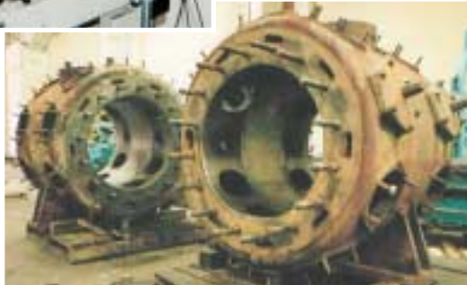
Large Bore Cylinder Reconditioning ▶