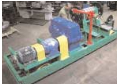
▼ Fabricated Lifting Trolley for a Hydroelectric Dam