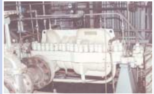
▶ Newly Rebuilt Boiler Feed Pump